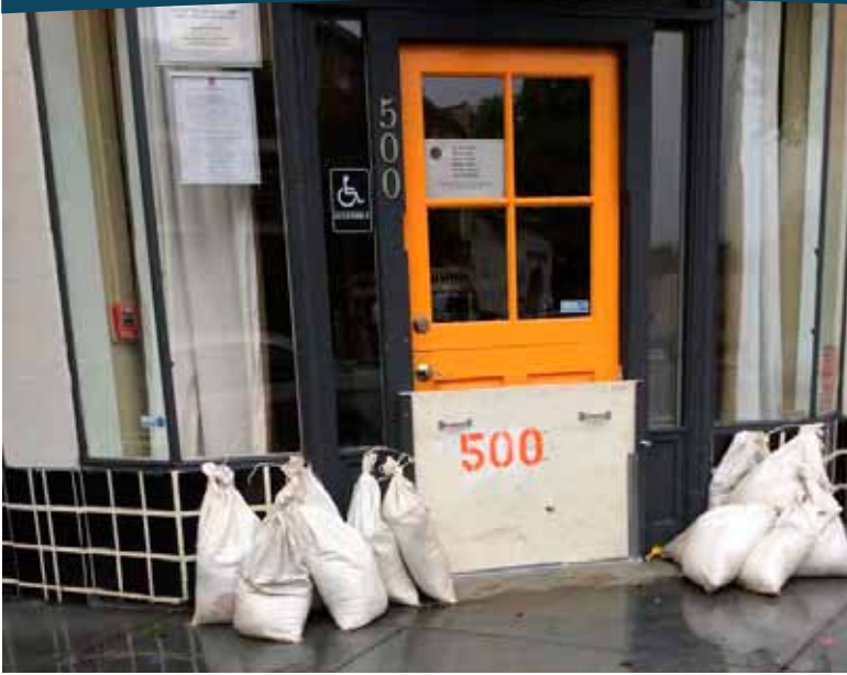
Merchants prepare for stormy weather by protecting storefronts with sandbags and floodgates.